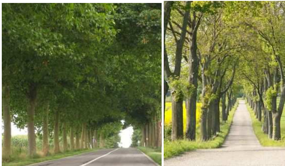
Figures 52 and 53: Tunnel or cathedral? Tree-lined roads in Belgium and Poland (Warmia-Masuria).