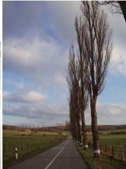
Figures 39 and 40: Double row of Swedish whitebeams, fashionable in the south of the country in the early 20 th century, and Lombardy poplars in Luxembourg.

The resources available to the planters and the availability of the trees also explain the differences between some types of plantation. This can still be clearly seen in Sweden today, where rows of trees along country roads were traditionally planted by local farmers, who generally used a mixture of different species found in the nearby forest. Meanwhile, from the 17 th century, wealthy landlords were able to import lime trees from Holland or Germany to create uniform avenues more consistent with the canons of formal beauty.