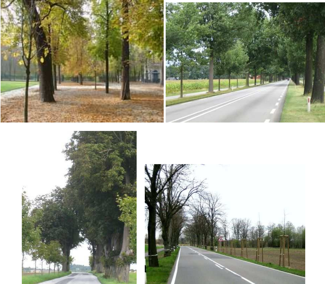
Figures 92, 93, 94 and 95: The practice of gap-filling is systematic in towns and cities and in parks, where significant effort is expended to maintain a high-quality environment. The variation in size becomes less obvious over time and is less stark in appearance than an avenue punctuated by ever larger gaps. Three examples of gap-filling roadside plantations: North-Brabant, Scania and Brandenburg.