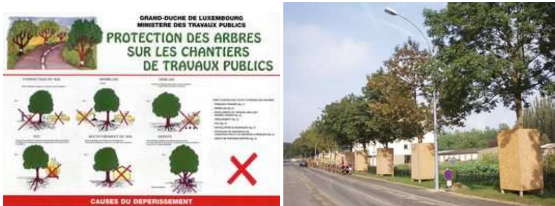
Figures 103 and 104: In Luxembourg, posters are regularly supplied to companies and distributed on building sites. Specialist forestry officers act as consultants in the planning of road works.

All excessive or over-vigorous pruning and tree topping must be outlawed, in favour of gentle pruning operations only, undertaken by trained arborists who climb the trees. This technique, which is mandatory in some French départements and in Wallonia for outstanding tree rows, is the only way arborists can enter the crown to remove dead wood and improve airflow among the upper branches, giving the tree improved transparency and greater stability in high winds. Special types of pruning may be practised if they reflect historic or local traditions, such as willow pollarding in south-east Sweden.