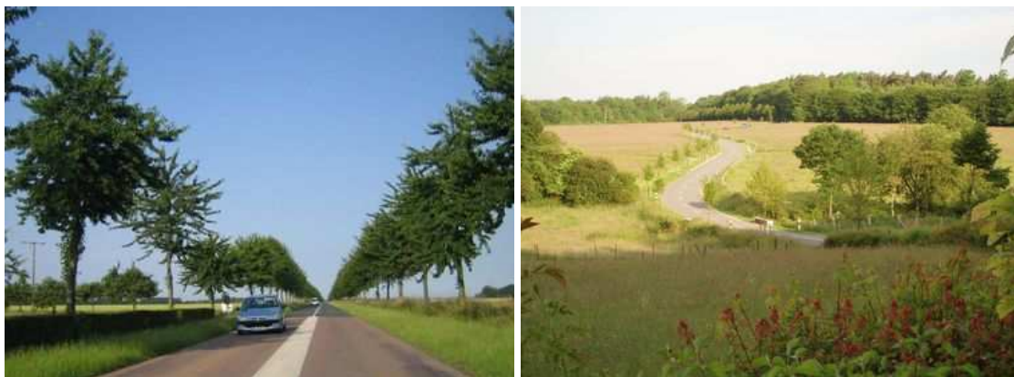
Figure 96: This double row of wild cherry trees in France is about 20 years old. Figure 97: Even though it is still young this new plantation in Luxembourg already creates a presence in the landscape.