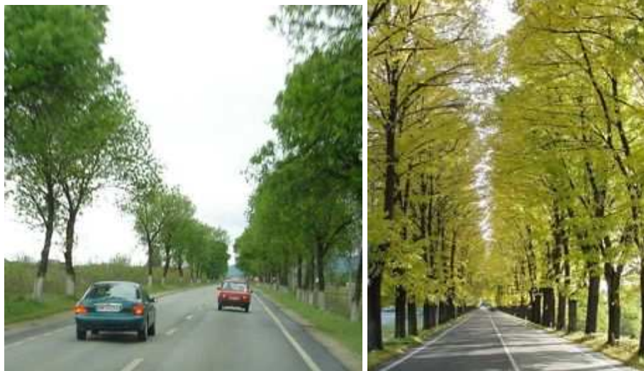
Figures 33 and 34: Tree-lined roads in Romania and Italy.

Although tree-lined roads have existed far beyond the European arena, their rapid dissemination across the western world is closely linked with the influence of the French style of gardening: this is reflected in the use of the terms “allée” and “avenue” in many countries, terms which are also used for tree-lined roads in the open countryside. Having founded the École des Ponts et Chaussées in 1747, France exported both its expertise in road construction and its engineers’ taste for regular planting schemes, and this also played an important role.