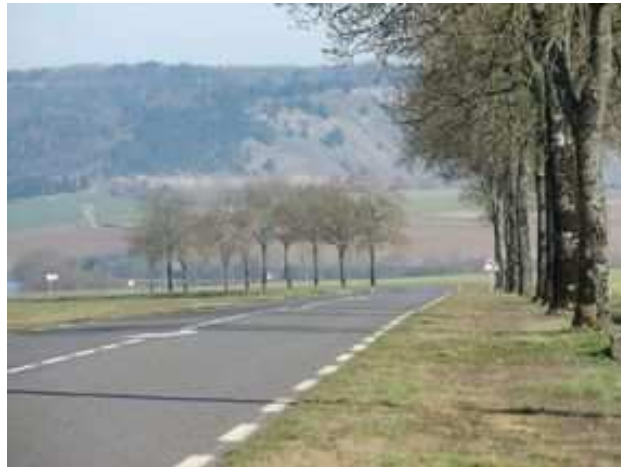
Figure 13: In 1895, 87% of roads in the French département of Meuse were lined with trees on both sides: a total of 44,000 trees. Now just fragments of this heritage remain, comprising less than 7,000 trees in all.

of the most aware of its heritage, now has less than one tenth (17,500) of the number of trees planted along its roads in the late 19 th century (200,000).