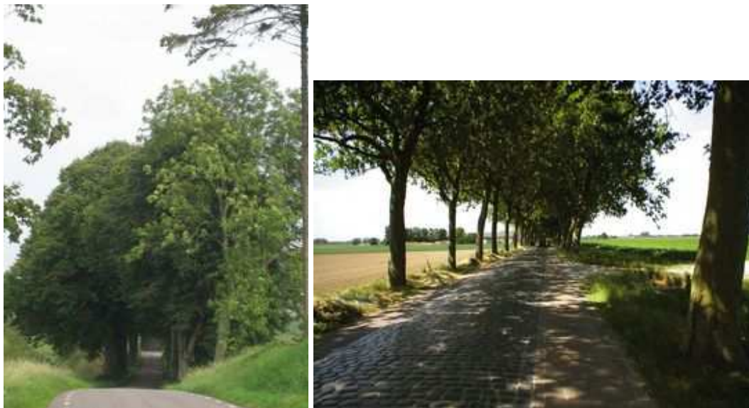
Figure 85: Many country roads can cope with moderate levels of traffic, with features which are already sufficient for the purpose, as here in Sweden. Figure 86: This photograph from the Dutch CROW guide no. 259 " Plattelandswegen mooi en veilig " (roads in the open countryside: beautiful and safe) shows that sustaining trees and historic road surfaces is compatible with contemporary government and a policy of "Sustainable Safety". The use of different coloured paving stones creates the illusion that this is a single traffic lane, making users more vigilant and careful.

Road infrastructures are evolving and our towns and cities are changing: traffic levels are increasing, soft modes of transport like the bicycle are becoming more popular, as are light rail systems. Yet this in no way conflicts with the aim of sustaining tree-lined roads in the urban environment or in the countryside. The first question to be asked, as a Prussian edict dating from far back as 1841 points out, is whether new developments are really necessary: only a small number of routes generally carry large volumes of traffic, so is it necessary to incur significant expense to widen or straighten roads serving local traffic needs? Would it not be better to educate drivers on road sharing issues, which will improve safety for all road users everywhere?