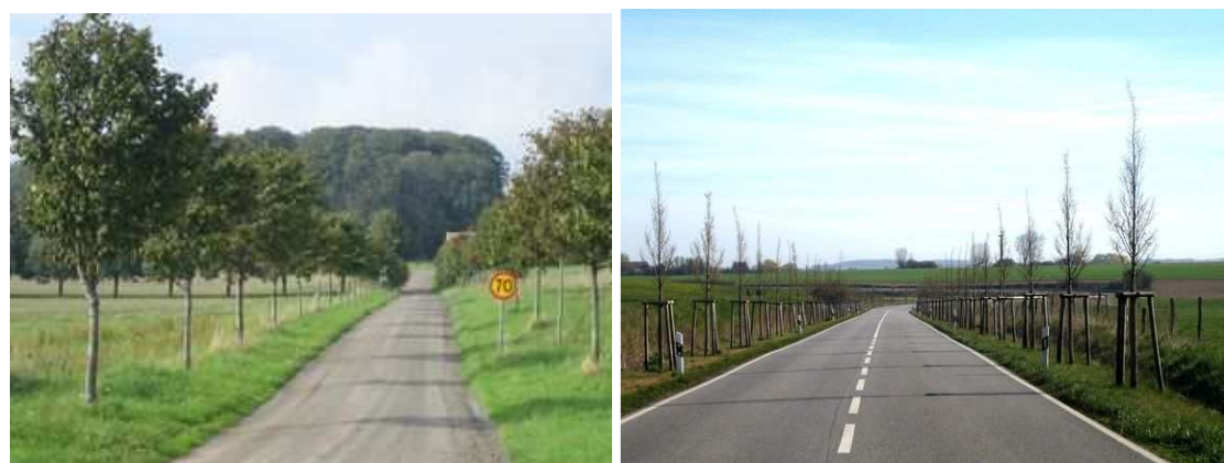
Figure 98: A young plantation in Sweden. Figure 99: This new plantation, extending over nearly 3 kilometres, is made up of hornbeams planted close together and close to the road, already creating a visible ‘avenue’ effect. The German state of Mecklenburg has lined 1,750 km of roads in this way since 1990.