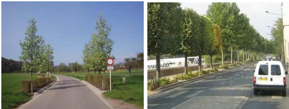
Figure 62: A double row of trees set in a low clipped hedge signals the approach to a built-up area in Luxembourg. Figure 63: Alongside the Seine, near Paris, a sequence of clipped lime trees takes the place of free-growing plane trees. The change visually signals an intersection, is aesthetic, and also acts as a safety barrier to stop disease spreading in the event of an outbreak of canker stain.

In 1916, the British writer R. Farrer described the approach to the battlefield of the Somme, to the north of Paris: "Along the voluminous velvety roads one rolls under plummy avenues of trees. And then the road becomes less velvety, and the avenues by degrees less plummy, till at once they are only stark skeletons, gap-toothed and shell-shattered in their rows" (Gough, 1998).