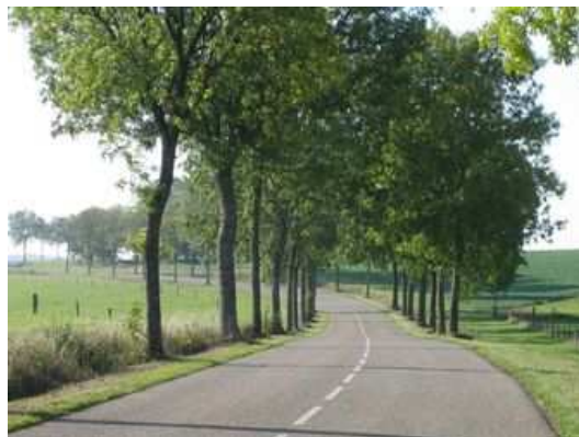
Figures 74 and 75: Two philosophies of travel – one mechanistic, the other hedonist.