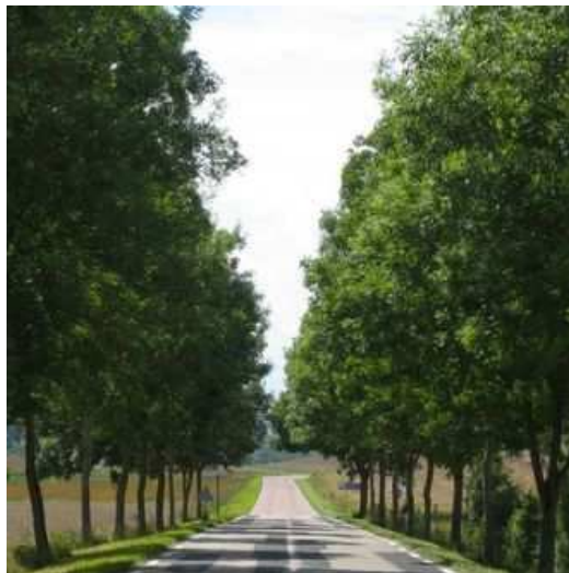
Figure 108: Tree-lined roads in France do not benefit from general protection. The result is clear: two départements , two different approaches. After the tree felling of the 1990s a tree avenue which once lined the whole road now stops at the "border".

Is it enough to know that trees should not be cut down, and that we need to plant, manage, communicate, and promote road safety in order to ensure that this heritage survives? Can the future of tree-lined roads depend solely on the goodwill, cultural sensitivity and commitment of managers or elected officers whose career paths and mandates obey timescales very different to the lifespan of these trees themselves? Should this future be dictated, ad-hoc, by changing pressures and requirements even though we know that a tree cannot be "rebuilt" – unlike buildings, which may at times have been saved from disappearing altogether in this way?