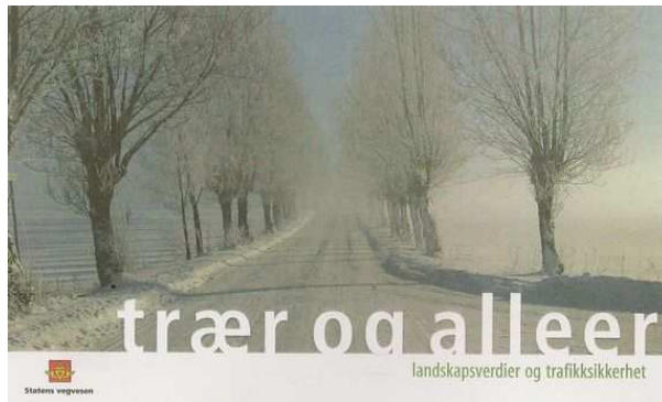
Figure 72: In fog, when there are no road markings, trees provide valuable assistance. Figure 73: Norway’s roads department highlights the vital role played by tree avenues in a country with snowy winters.

The trees lining past help drivers maintain awareness of their speed without looking at their speedometer. By channelling lateral vision they also encourage prudence, whereas an open roadway reduces vigilance and encourages speed. Finally it should be noted that research has demonstrated a link between the beauty of a road and higher levels of road safety.