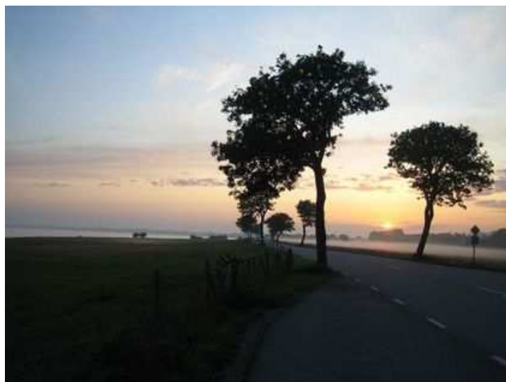
Figure 32: Remnant of rows of Swedish whitebeams along a coast road in Scania (Sweden).

In these three cases replantings have been either non-existent or nowhere near sufficient to make up for the losses. Will we have to echo the 19 th -century engineers of France's École Nationale des Ponts et Chaussées (national school of civil engineering) who observed that there were "great stretches without any trees" and predicted that "soon we won't see any trees at all along our roads" (Rafféau, 1986)?