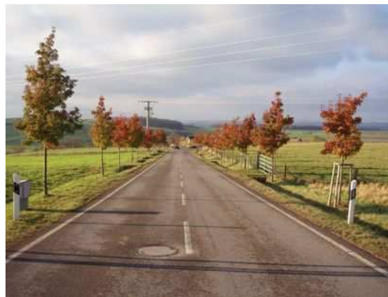
Figure 102: Young pear trees spaced at distances gradually reducing from 15m to 10m to signal the approach towards a village.

Figures 100 and 101: Where fields or other restrictions limit the space available there is only one thing to do: plant close to the road edge, particularly when the new tree is filling a gap as in the left-hand photo. In any case the rows of trees must be kept relatively close to one another in order to achieve an “arch” effect.