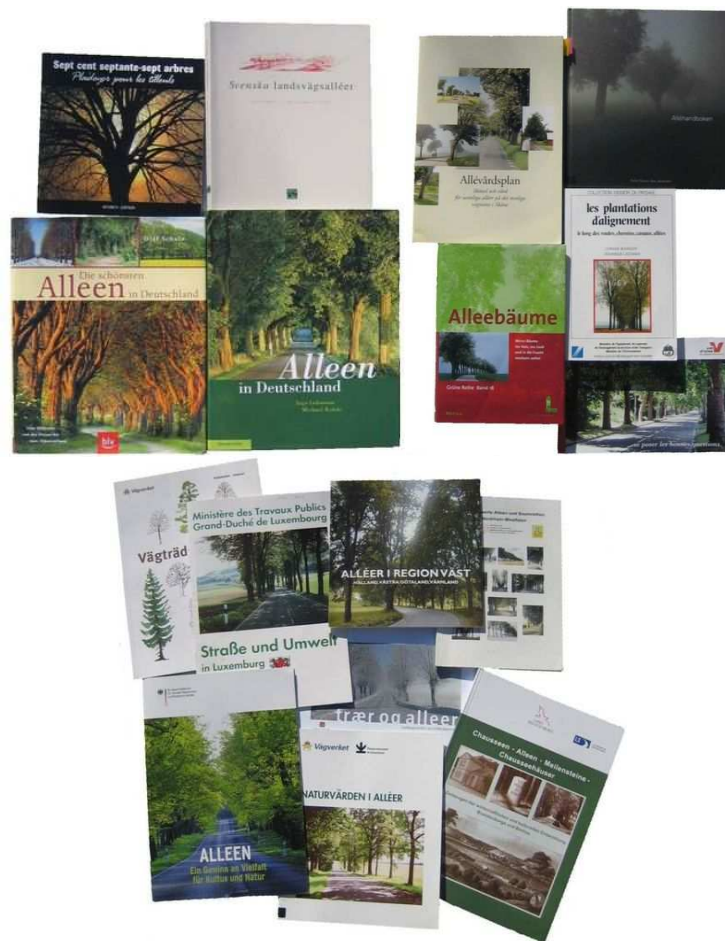
Figure 111: Research and consciousness-raising work is already under way in some countries. For more information please see the appended Bibliography.

Latvia, 2007, with presentations from France and Germany; Pisz, Poland, 2008, with presentations from Germany; Cernier, Switzerland, 2008, again with presentations from Germany).