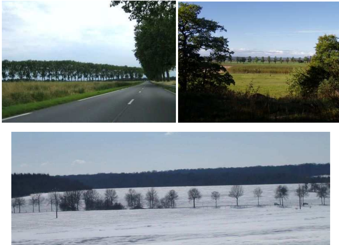
Figures 45, 46 and 47: A distinctive presence in French and Swedish landscapes.

In other words tree-lined roads structure the space of a landscape. This is true of the countryside, but it is particularly evident in towns, where the volumes created vary according to the shape of the trees selected and the way they are arranged – in the middle of the roadway or to the sides, for example.