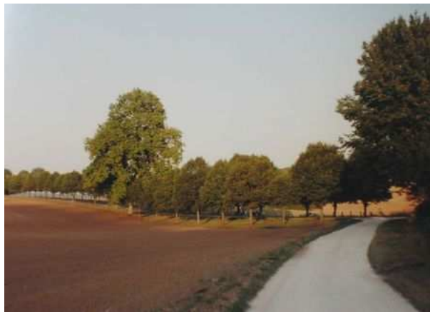
Figures 117 and 118: In the background we see the avenue of lime trees which extends over more than 2km in view of the Château de Commercy (France). It was planted around 1721 or 1750 and has been protected as an outstanding site since 1911. The ensemble, now partly located in an urban area, comprises nearly 500 trees, some of them more than a century old, and is regularly restored.