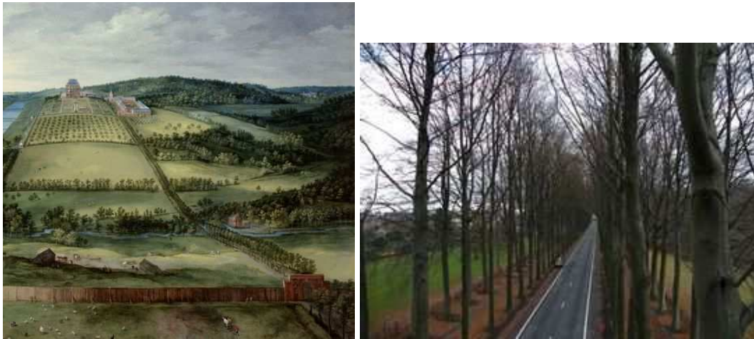
Figure 4: This painting, View of the Château de Mariemont by Jan Brueghel the Elder (1612), shows Chaussée Brunehaut, a tree-lined avenue leading to the chateau. Figure 5: Seven other hunting avenues were built on the estate including this one, which has survived through the centuries, becoming incorporated in the town as it has grown; it is known in Belgium as the "Drève de Mariemont"

Unlike Gothenburg in Sweden which dismantled its ramparts in 1807 and planted boulevards in 1823, and Brussels which did the same between 1820 and 1840, the northern French town of Soissons initially restored its ramparts in 1821. However they proved ineffective in the war of 1870 and so they were demolished and replaced by boulevards around 1885.