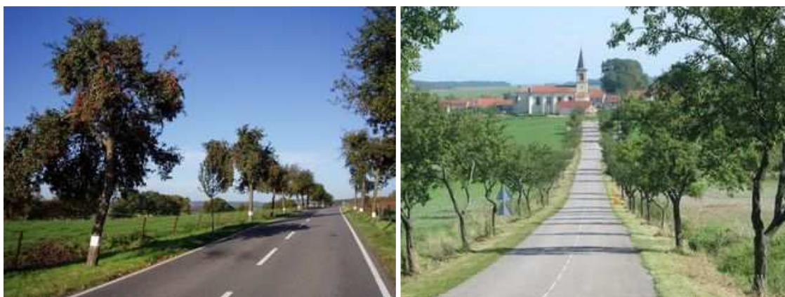
Figure 43: Fruit tree planting was substantially expanded in Luxembourg in the 1870s. One of the aims was to combat alcoholism by producing cider. Figure 44: Rows of mirabelle plum trees, traditionally identified with the Lorraine region of France.

In the second half of the 18 th century, Empress Maria Theresa of Austria encouraged the planting of avenues of fruit trees in order to boost fiscal revenues, because cider served in public was taxed. In eastern France in the 19 th century the Conseil Général of Haute-Marne ordered that all non-fruit trees should be cut down and that cider apple trees should be planted. Even though they represented 50% of trees planted in the region in 1920, they have virtually disappeared today, unlike the avenue of apple trees at Asknäs in Sweden, which was planted in 1887 and still standing in 1997.