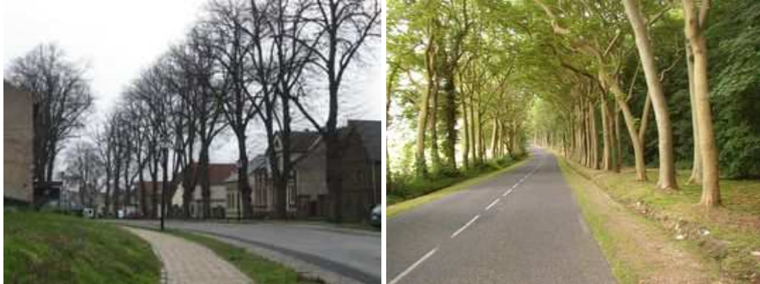
Figures 60 and 61: The landscape is unified by the row of trees. Disparate buildings merge together behind the regular screen formed by the tree-trunks; alternatively, the tree-trunks stand out against the darker backdrop of the forest, creating a distinctive mellow effect.

Rows of trees also provide a clue to reading the landscape. During the First World War, for example, tree-lined roads were a key feature in the iconography of the battlefields. On a more mundane level, the way trees are arranged and presented effectively signposts an urban environment or the approach to a built-up area: trees are more effective and attractive than other forms of signage.