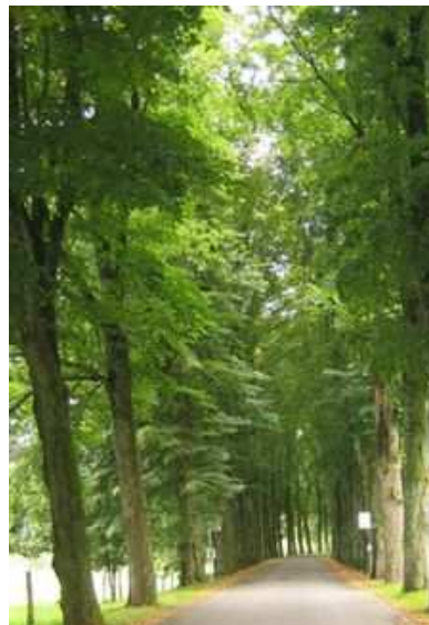
Figures 119 and 120: Two tree-lined roads which have been designated as outstanding and protected, one in Latvia, the other in Belgium.

Protection can also be limited to a given area, as with the "Alpilles" directive in France.