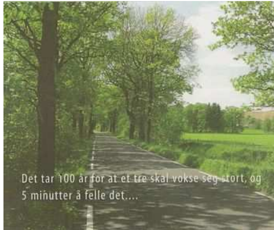
Figure 84: This brochure from Norway's roads department reminds us that it takes 100 years to make a tree but just five minutes to cut it down.