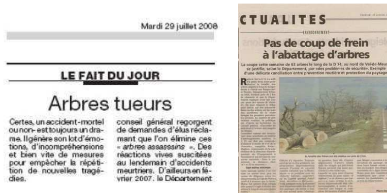
Figure 16: Trees are still accused of being the cause of deaths on the roads and whole rows of them are being cut down, as evidenced by the titles of these recent newspaper articles: "The killing trees" and "No brake on tree felling".

In the 1960s, Italian writer Gianni Roghi protested against the destruction of 260,000 trees lining Italy's roads over a five-year period, "on the pretext that they would be dangerous for drivers" (Roghi, 1964). In France, in 1970, President Georges Pompidou protested against a ministerial circular because "felling roadside trees will become the norm, under the pretext of safety." His protest apparently went unheeded: as recently as 2008 the Conseil Général of Mayenne was subsidising the felling of roadside trees. 4