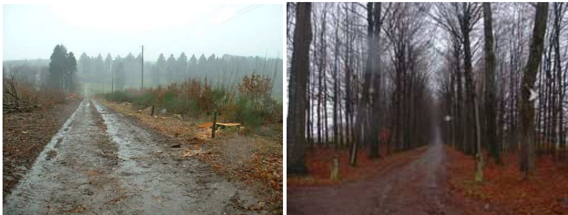
Figure 109: Near Neufchâteau in Belgium, a 750m double row comprising 247 beech trees with a heritage value of €2 million was cut down without authorisation. The case will be going to court.

Finally, flouting the regulations must result in sanctions, in the form of fines heavy enough to act as a deterrent, particularly in urban environments where major property development schemes are involved. These should be supplemented by compensatory measures, which should also apply in cases of dispensation. They should be sufficient to compensate for the losses incurred and must therefore be based on the asset value of the tree rows.