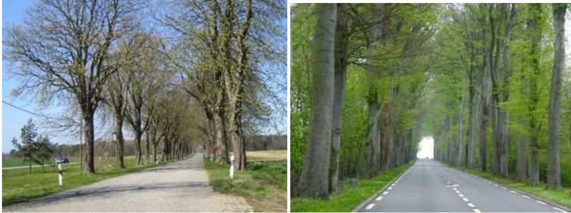
Figure 87: This historic road in Mecklenburg, retaining its original paving and its trees, is used for local traffic. Through traffic has been diverted onto a new road which runs parallel to the old one (on the left in the photo). Figure 88: On this Route Nationale (main road) in northern France, heavy goods vehicles travelling uphill use a parallel lane located beyond the avenue of tall beech trees.

When traffic levels and the road's function require it, one potential solution is to create a new parallel roadway and to divert onto it all or part of the road's traffic (either traffic flowing in one direction or a particular type of vehicle).