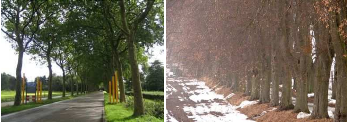
Figures 78 and 79: Both country roads and hidden byways deserve to retain the trees that adorn them (Netherlands and Poland)

In 2005, Denmark's roads department observed that "tree-lined roads constitute [...] an important element of our culture and our environment and merit special conservation as elements of our culture and landscape" – an opinion shared by the Swedish roads department.