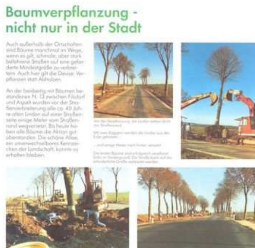
Figures 91: Luxembourg has transplanted 1,000 trees in recent years with a long-term success rate of 99%. One of the examples presented in the brochure "Straße und Umwelt in Luxemburg" (roads and the environment in Luxembourg) shows a road-widening scheme in which one row of trees is transplanted.

the same site. In Sweden, when the road between Kyrkheddinge and Hemmeslöv was widened in 1919 the decision was taken to transplant the roadside trees.