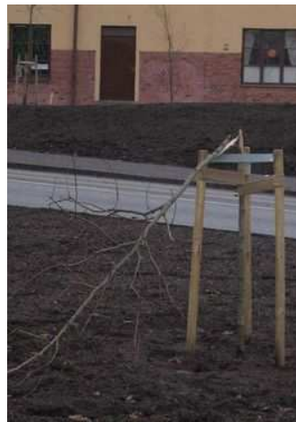
Figures 28 and 29: Examples of vandalism in France and Sweden. In the Netherlands, a car dealer infuriated by the tree in front of his showroom resorted to poisoning; in Luxembourg, nearly 1,000 trees have been vandalised since 1994.

Other attacks may be less obvious because they are less visible, but they are just as damaging, including asphyxiation caused by compacting the soil around the tree, and changes to its hydric environment. These conditions may arise when the water table is lowered, when leaks from underground pipe networks are repaired, when irrigation of neighbouring agricultural land is discontinued (as in the south of France), with embankment works – even temporary ones, and in particular when the level of the highway is altered.